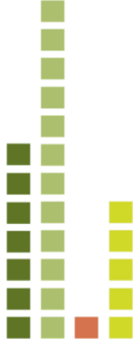
(As of Jan. 30)

Twenty Native American tribes have also submitted hemp production plans. Five more are drafting plans.